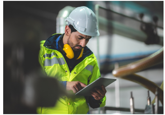
Fig. 1 Gas Measurements are vital for ensuring safety of personnel and facilities.

Accurate and precise gas measurements play a vital role in environmental monitoring and protection. Monitoring emissions from industrial processes, vehicle exhausts, or natural sources helps assess air quality, identify pollutants, and develop strategies to reduce environmental impact. Reliable measurements are essential for tracking compliance with emission standards and implementing effective pollution control measures.